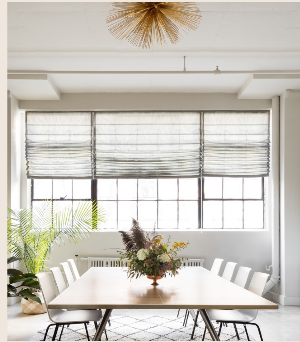
THE CONFERENCE ROOM